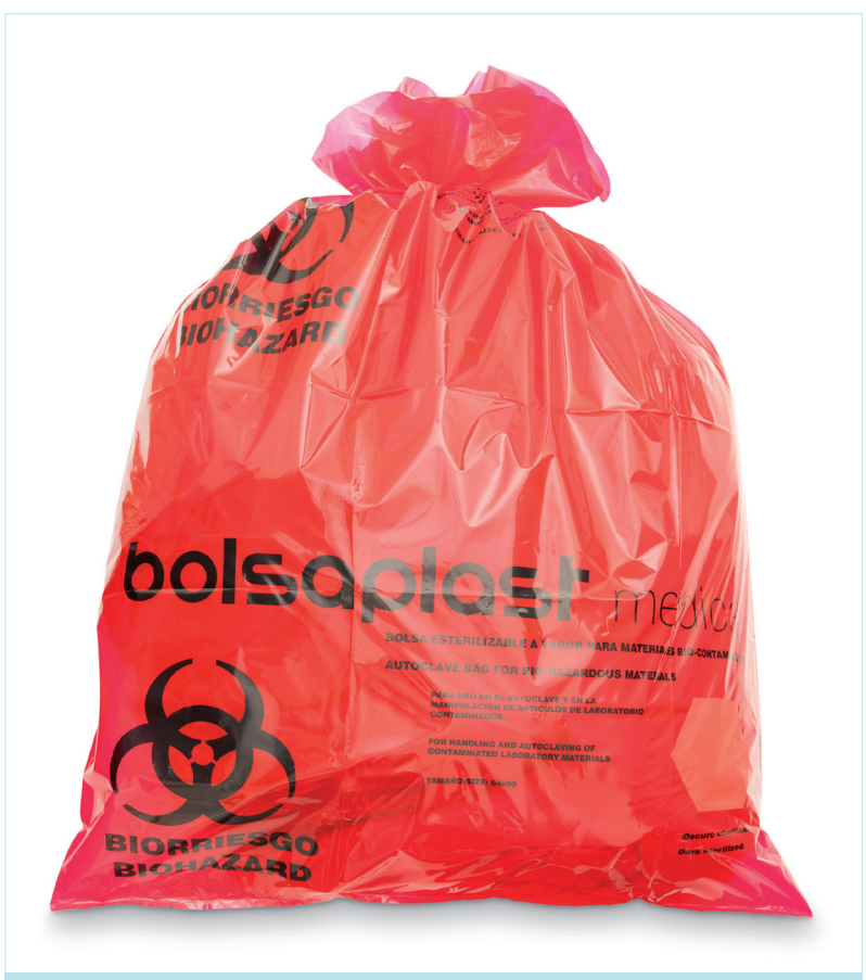
Excellent quality bag, easy visibility of printed text and STEAM indicator. In red colour, for risk identification